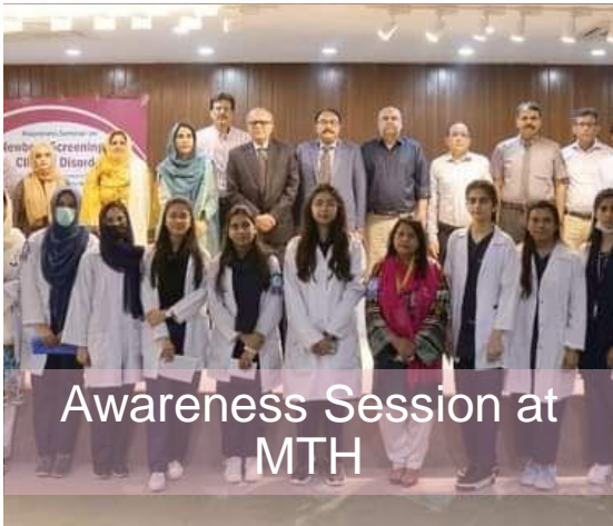
Awareness Session at MTH