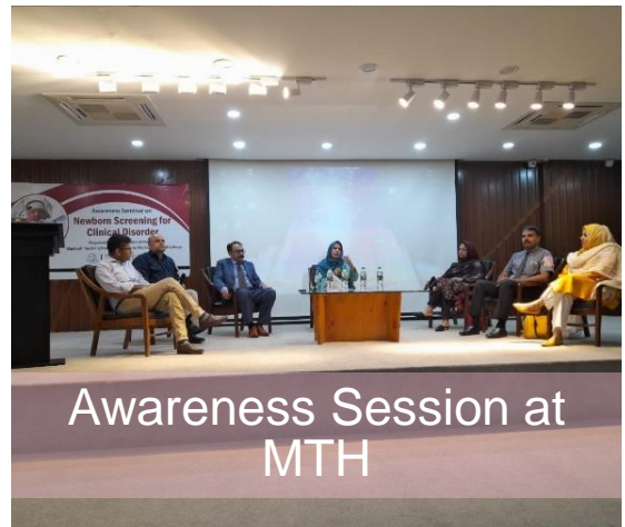
Awareness Session at MTH