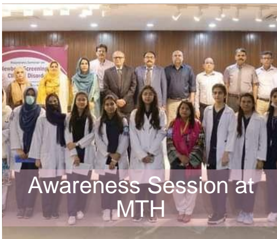
Awareness Session at MTH