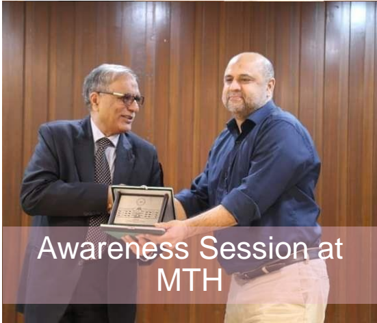
Awareness Session at MTH