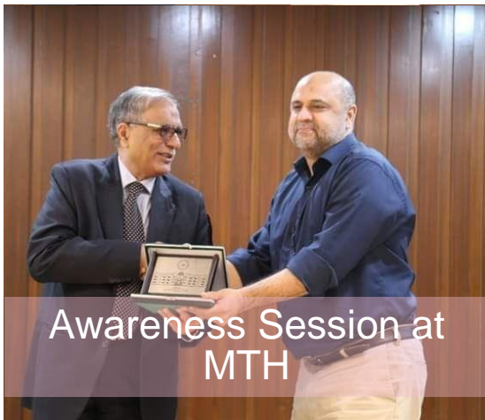
Awareness Session at MTH